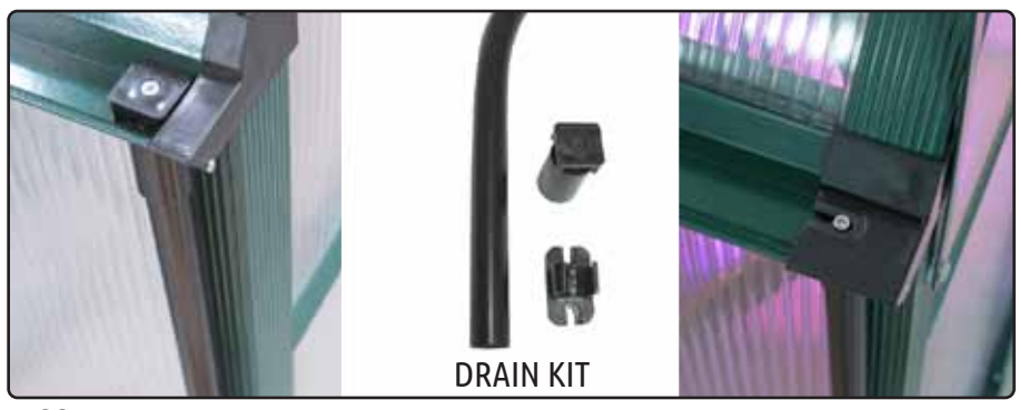
ASCENT AND ELEMENT END CAP WITH DRAIN KIT